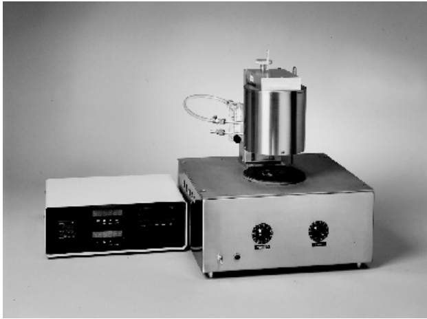
Model C-2500-HTS Conductivity System

The Model C-2500-HTS Thermal Conductivity system is designed for measuring the thermal conductivities of highly conducting materials from room temperatures to 1000°F. Sample dimensions are 2 1/4" diameter, and thickness range between 0.0005" to 1.000".