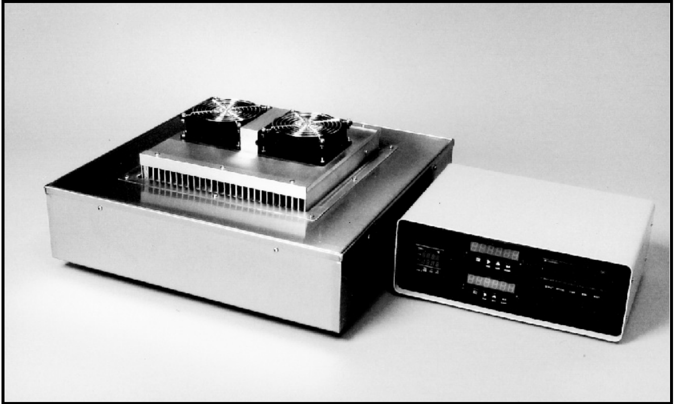
C-600-S Thermal Conductivity Cell

The model C-600-S Thermal Conductivity Cell is designed to measure the thermal conductivities of all solids within the range of 0.015 to 5 Btu/hr.ft. ° F (0.025 to 8.6 W/M ° C).