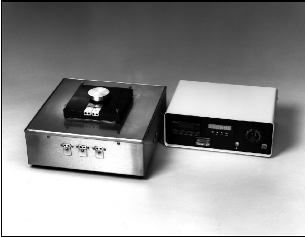
C-600-L Thermal Conductivity Cell For Liquids

The model C-600-L Thermal Conductivity Cell is designed to measure the thermal conductivities of most liquids within the range of 0.5 to 15 Btu/hr.ft. °F /in.